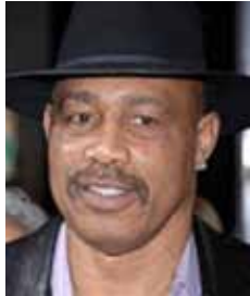
KEN NORTON BOXING CHAMP