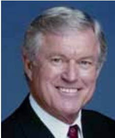
DICK VERMEIL SUPER BOWL CHAMP, RAMS