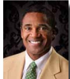
MIKE HAYNES NFL HOF, RAIDERS

As a sponsor, you are invited to the next California Sports Hall of Fame Induction. The one day event will feature; sports and entertainment celebrity guests, silent and live auctions of rare memorabilia's, and the induction of outstanding sports heroes. Entertain your clients, employees and yourselves while supporting The California Sports Hall of Fame's effort in granting scholarships to disadvantaged student athletes.